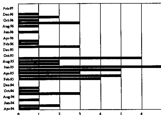
Figure 1 - Klystron Failures by Month

The spec requested tubes with at least 20-25k hours life. Overall, even with a high number of early failures, the MTBF was around 22k hours by 1994. Currently, the hours/failures ratio shows about 90K hours of filament operation and 67k hours of HV operation average. None of the failures so far has been from normal wear out, that is, cathode depletion. Instead, catastrophic failures have ranged from open heaters to external arcing.